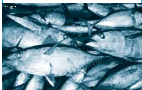
Tuna waiting to be put into cold storage