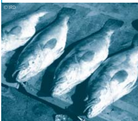
Thiof at the Gueule-Tapée market in Dakar, Senegal

Moreover, when the high-value octopus and other invertebrates are, in turn, over fished and replaced by species further down the food web, with lower economic value, then the full extent of the ecosystem shift will be felt in economic and social terms. It may, at that stage, be very difficult to re-establish the old production balance. The process of renewal could take a very long time or may indeed not be possible at all.