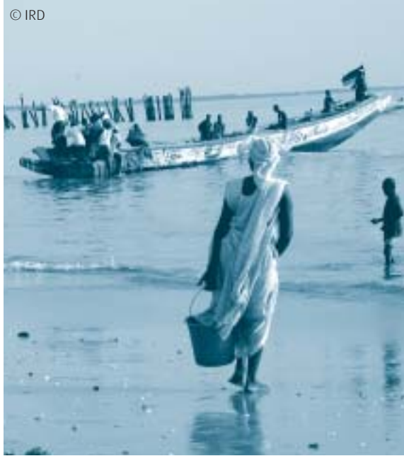
Pirogue in Senegal

A lack of understanding of ecosystems function and how they interact with social and economic systems has contributed to the present sorry state of affairs. The narrow organisation of research along single-disciplinary lines has not helped. The Ecosystem Approach to Fisheries (EAF), which is gaining in strength and influence, provides a more holistic approach for the future management of fisheries resources. The EAF is an extension of conventional fisheries management, recognising more explicitly the interdependence between human well-being and ecosystem health and the need to maintain the productivity of ecosystems for present and future generations. Together, the EAF guidelines, and the 1995 Code of Conduct for Responsible Fisheries adopted by the FAO Conference, provide the crucial framework for any effective approach to fisheries management.