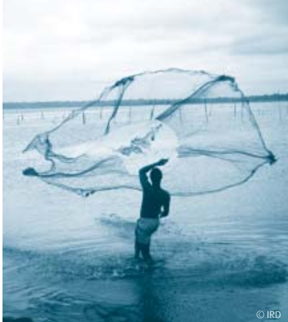
Casting the net, Ivory Coast

Whilst international demand for marine products provides important revenue for governments and for larger-scale fishing operations, it is sometimes to the detriment of local populations. The pressure on prices is such that in certain cases local produce becomes unaffordable and national consumption is decreasing. This leads to a situation in which the economic survival of the sector becomes dependent on the external factors. This is far from ideal from an economic viewpoint and should also give rise to concern from a food security point of view.