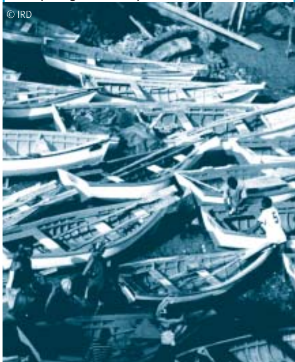
Local fishing boats in Cape Verde

The declaration adopted by the participants of the Dakar Symposium expresses the awareness that changing course will not be easy and will engender initial costs. But it also conveys the firm determination that not to do so will be infinitely more costly and devastating, and that dialogue-based solutions can be found that establish a new balance between immediate and future costs and benefits.