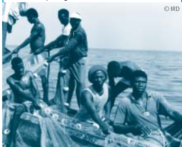
Small-scale fishing in Guinea

The opposition between conservation and development can also be transcended. The multifunctional nature of West African fisheries, which fulfil economic objectives (jobs, income), provide food security, and generate foreign currency, confirm the complementarity of resource conservation and product development: resource management conserves substantial revenue.