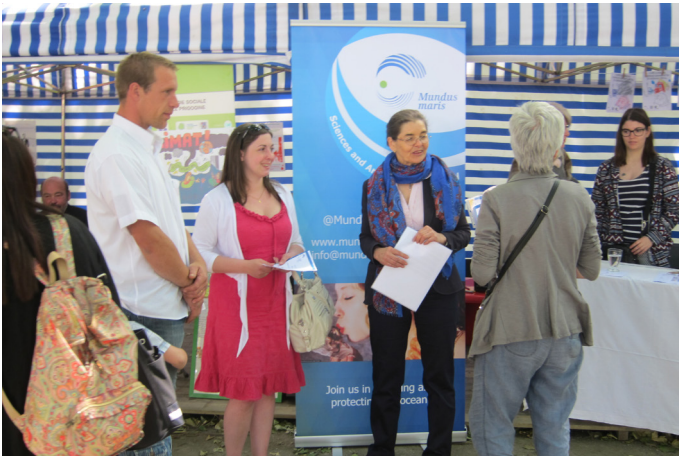
Mundus maris stand for World Oceans Day celebrations in Brussels just before the announcement of the winners

A video about the march, beach cleaning and ceremony in Kilifi County, Kenya, is available on our YouTube channel.