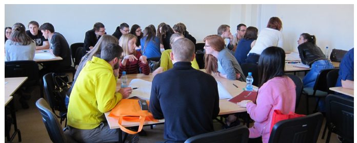
World Café style intense conversations among small groups of Baltic students exploring priorities for making food production and consumption sustainable.