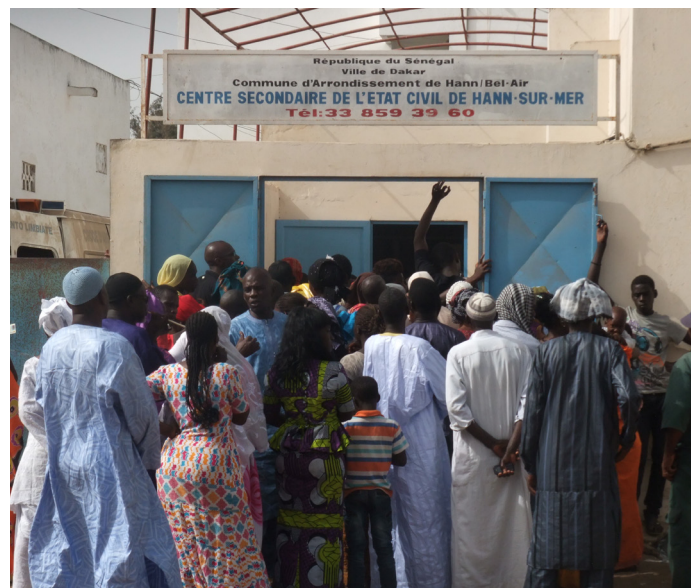
Large crowds gathered throughout the day for the special session of the judge to regularise the kids' birth certificates

The problem with school drop-outs in Senegal is reaching into every corner of the country. In the preparation of last year's World Ocean Day activities in the fishing village of Hann, we were more regularly confronted with the fact that kids without birth certificates could not complete their secondary education and thus see their chances for better futures jeopardised. From a few initial labour-intensive test-cases solved last year, it became clear that a more systematic approach would be needed, even though the