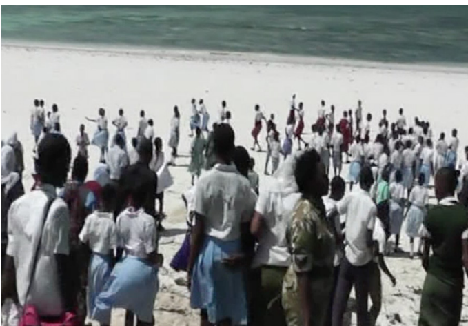
Beach cleaning at Baobab Beach in Kilifi County, Kenya

A video about the march, beach cleaning and ceremony in Kilifi County, Kenya, is available on our YouTube channel.