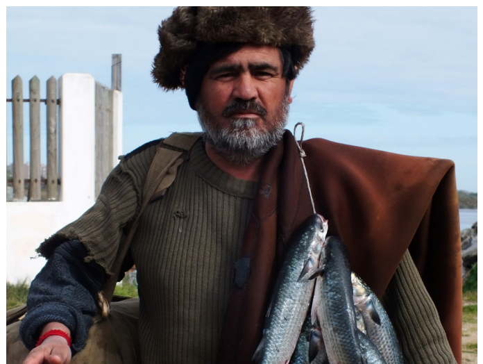
Shot of an artisanal fisherman in Chile for the documentary